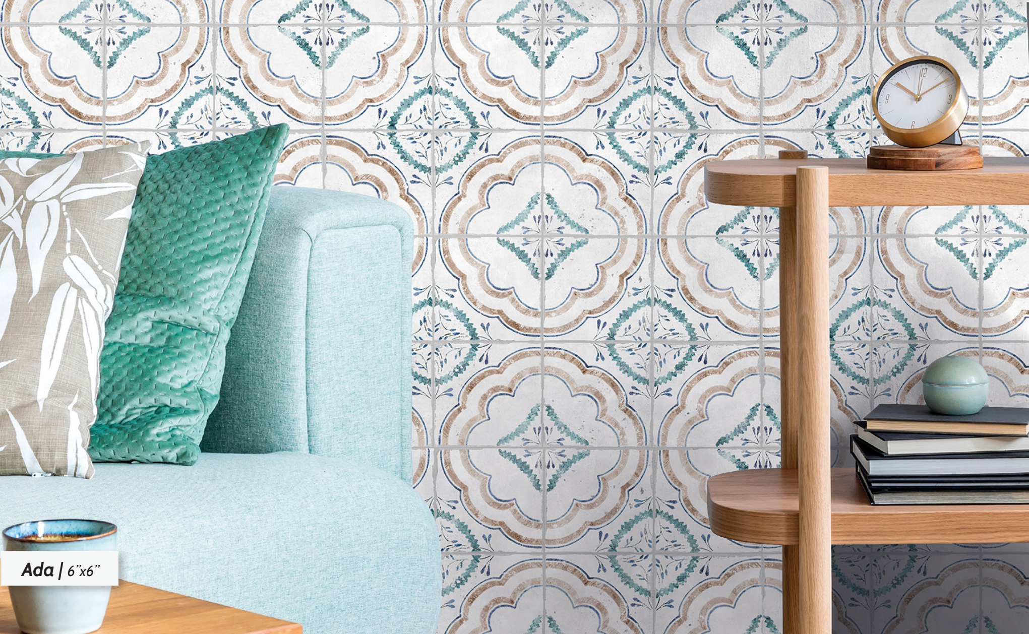
Ada | 6"x6"