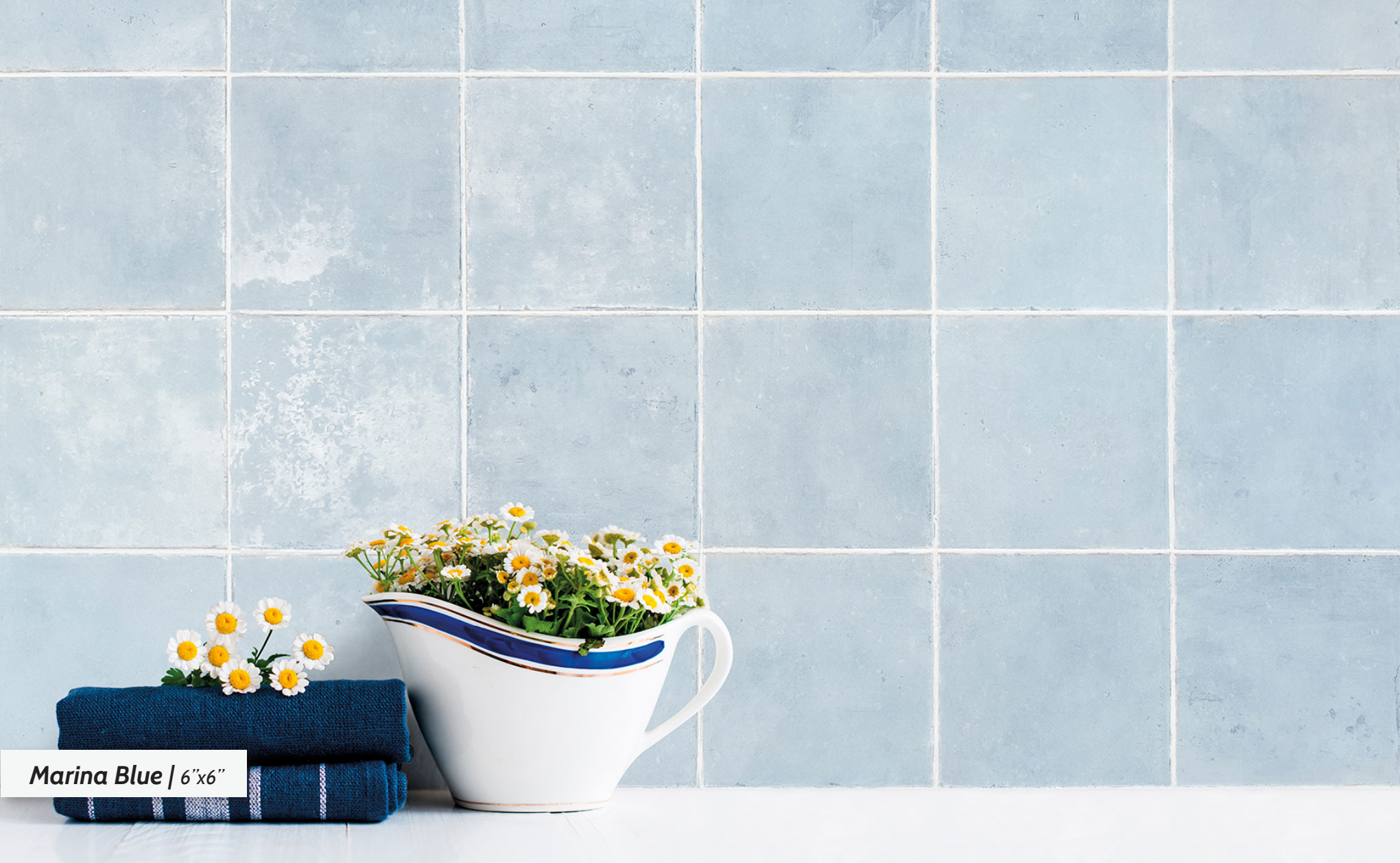
Marina Blue | 6"x6"