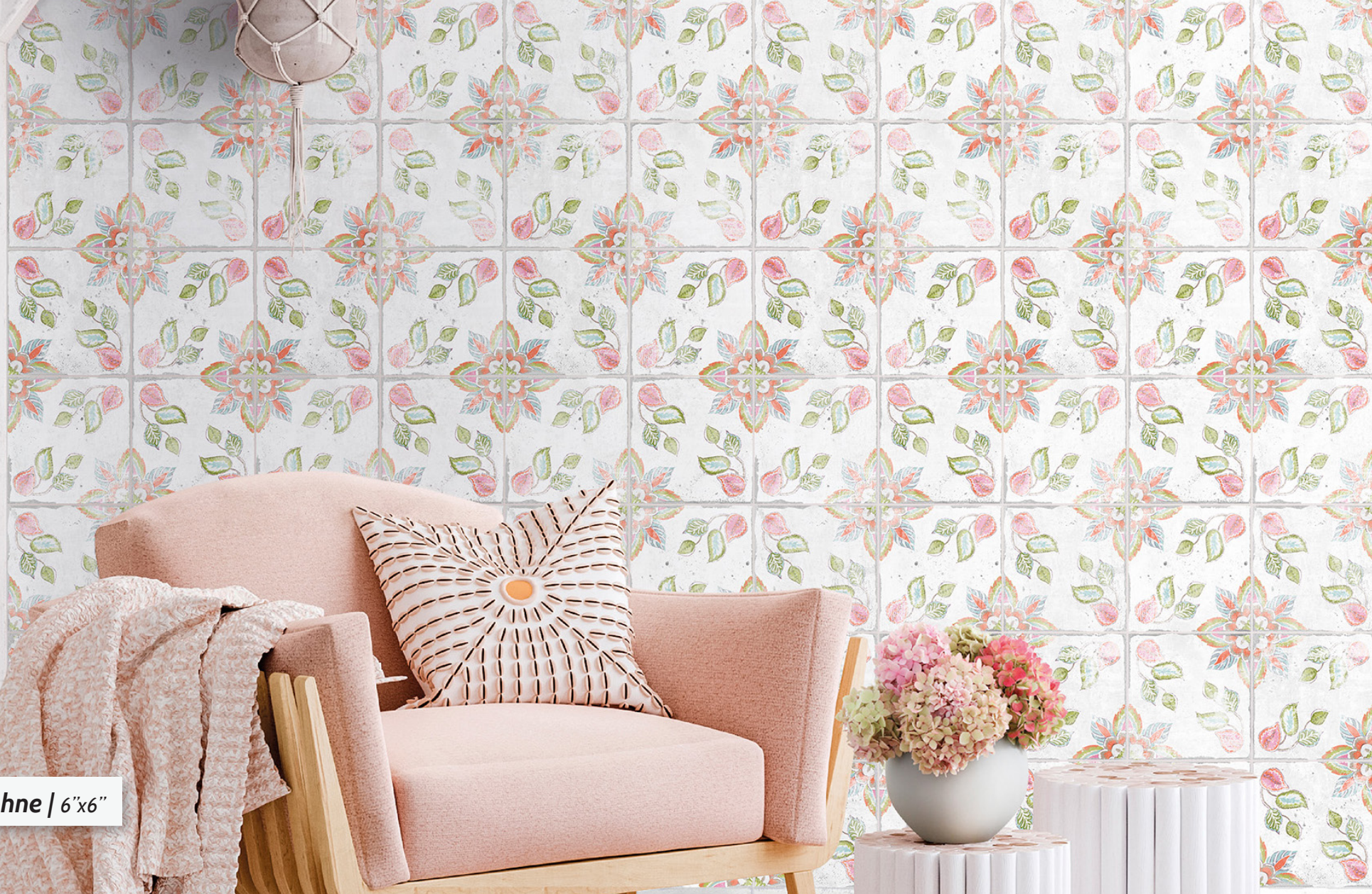
Daphne | 6"x6"