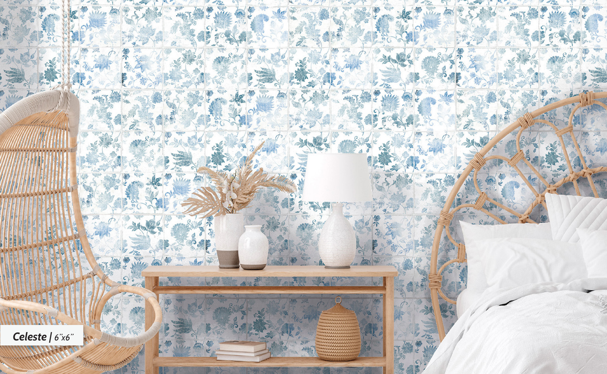
Celeste | 6"x6"